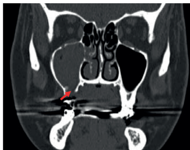
Figure 3. A presurgery CT. The coronal image shows the right maxillary sinus with an oroantral fistula on the inferior wall of the maxillary sinus.

Foreign bodies in the maxillary sinus such as root canal cement,